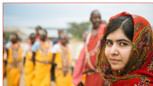
Malala won the Nobel Peace Prize for her work for girls.