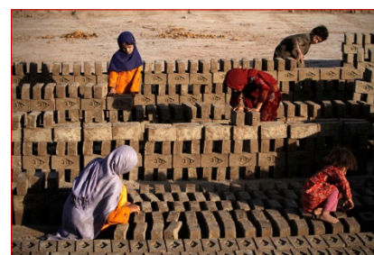
Children at work in a factory